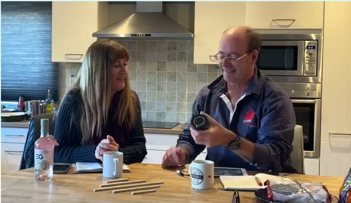
A live show screenshot from October 2023